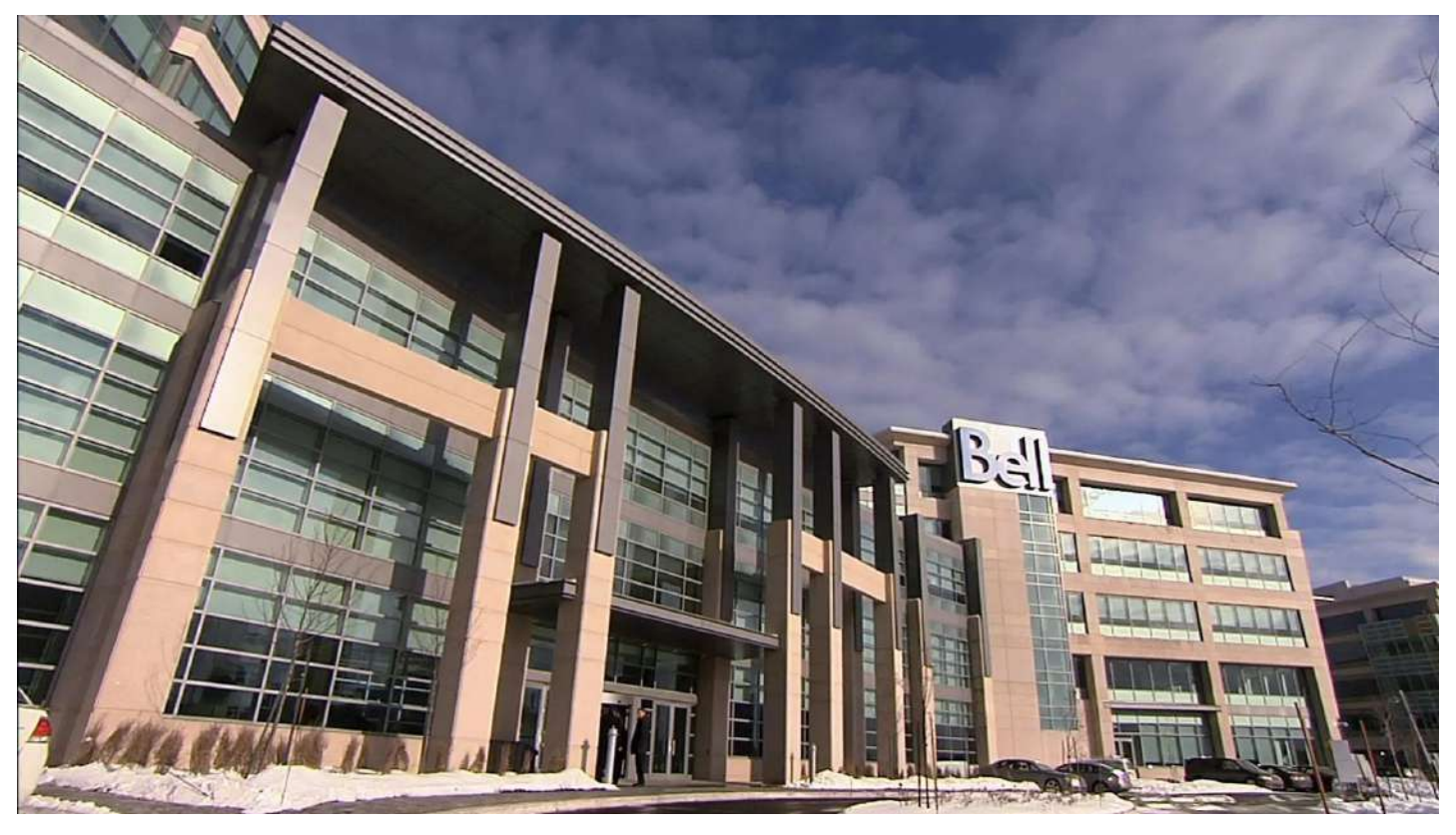
Bell Media headquarters in Toronto.

"No version of the Attachment is provided on the public record, as it would not provide meaningful disclosure."