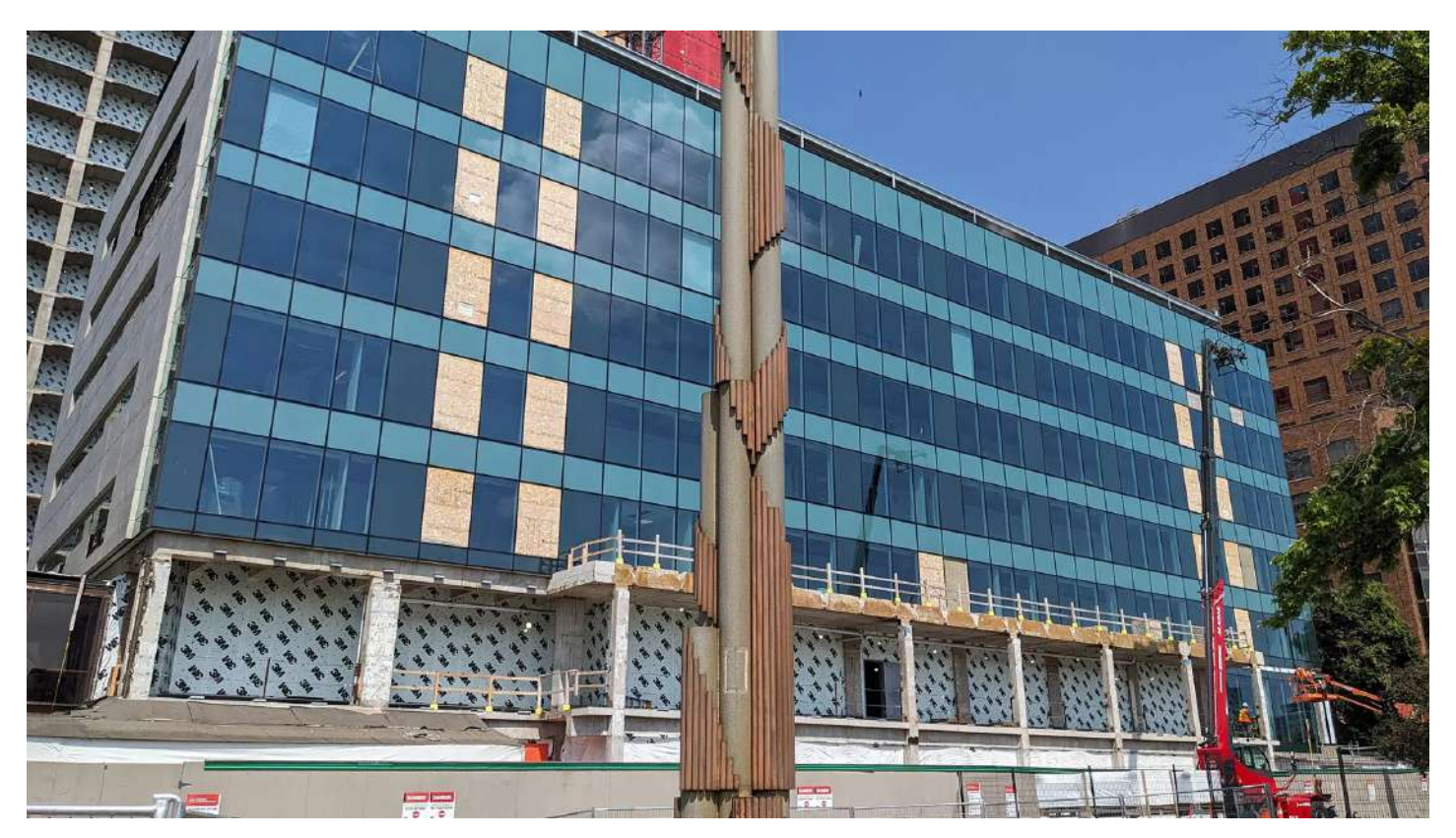
The Canadian Radio-television and Telecommunications Commission (CRTC)'s headquarters in Gatineau, Quebec.

It declined to answer if the proposed deal would impact the ongoing hearing or delay it further, stating it cannot comment on open proceedings.