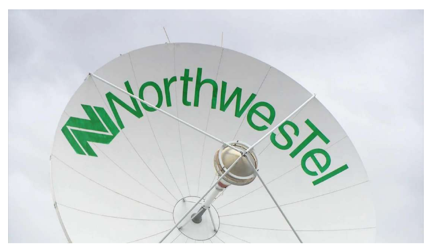
A Northwestel satellite in Whitehorse.

SNU's website said it's open to discussions from other Indigenous organizations in the North interested in joining the consortium and that a number of additional Indigenous organizations and corporations are "analyzing the opportunity."